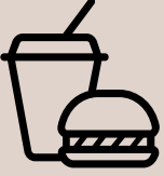
Food & Beverages

Halal Trade, Logistics and Manufacturing Expo will further strengthen Africa's position as a global halal hub and put forward the economic values of Halal for the world.